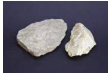
Stone age tools on Kasteelberg showing their distinctive chiselled edges

Completed in 1863, this church, now the Valley Museum, is one of two in the Valley dating from the same period and gives a clue to why two small villages exist in such close proximity. The recently restored (Kloovenburg)